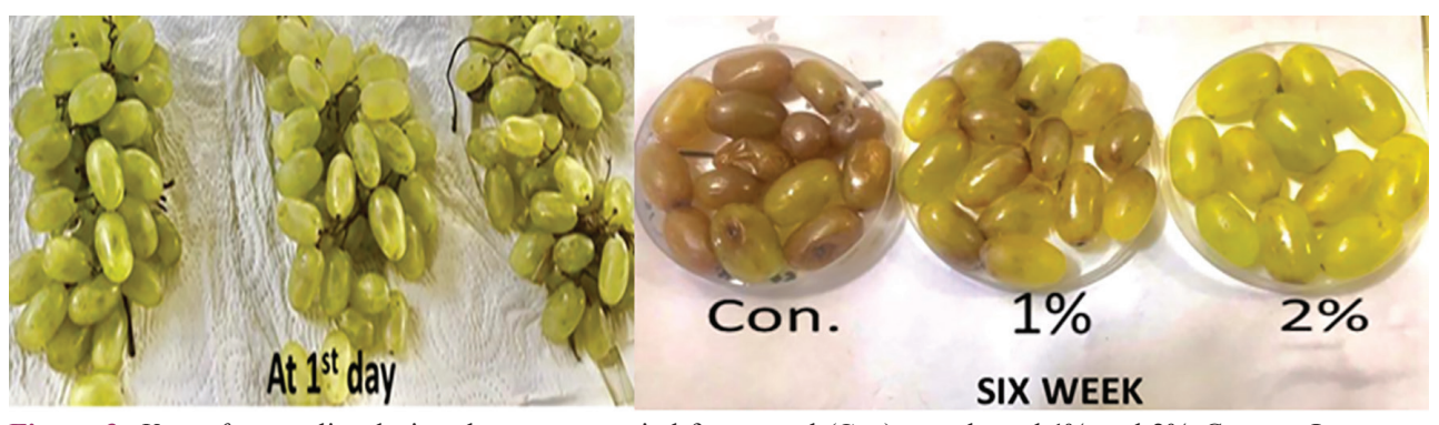
Figure 3: V. vinifera quality during the storage period for control (Con) sample and 1% and 2% C. myxa L. extract (CME) at the 1<sup>st</sup> day and 6<sup>th</sup> week.

evaluation of the 1% and 2% CME samples was good and very good, respectively, but the control sample was completely damaged. The sensory evaluation in the end of storage period for fruits in 1% CME was satisfactory and in 2% CME was very good.