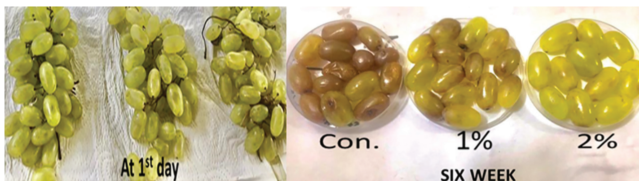
Figure 3: V. vinifera quality during the storage period for control (Con) sample and 1% and 2% C. myxa L. extract (CME) at the 1 st day and 6 th week.

evaluation of the 1% and 2% CME samples was good and very good, respectively, but the control sample was completely damaged. The sensory evaluation in the end of storage period for fruits in 1% CME was satisfactory and in 2% CME was very good.