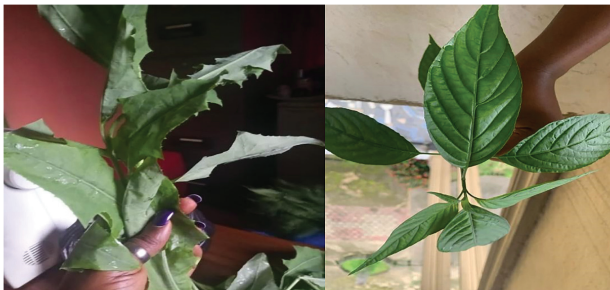
Figure 1: Fresh leaves of T. officinale dandelion (left) and J. carnea plume flower (right) before the experiments.

The gravimetric method was applied to determine moisture content. The initial weight of the wet material was compared to the weight of the water it contained to determine wet moisture content (19). A sample of 10 g was weighed before and after drying in the oven at 105°C to the constant weight. The dry moisture was calculated as a percentage of the ratio of moisture loss to the weight of samples analyzed. Ash percentage was determined by the furnace incineration gravimetric method. The organic component of 5 g of each sample was burnt off at high temperature of 600°C in an electric muffle furnace until the sample became gray ash. The ash was cooled in a desiccator before it was reweighed. The weight of inorganic matter that was left was calculated by difference as a percentage of the sample analyzed. The ash was reserved for acid extraction and subsequent mineral determination.