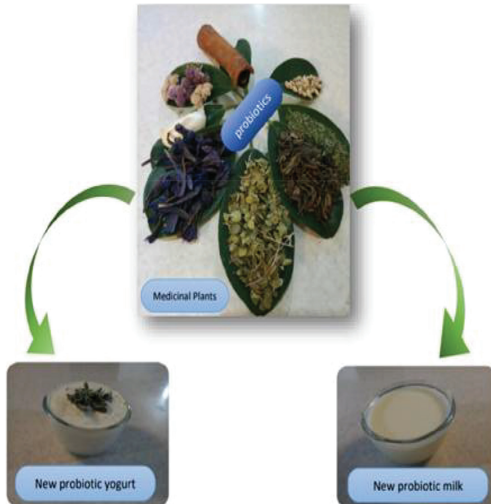
Figure 3: The combination of medicinal plants and probiotics produces milk and yogurt with a better taste, smell, and consistency.

probiotic bacteria was shown to produce a significant difference with the control sample revealing that the concentration of chicory did not have a significant effect on the initiator bacteria, but could increase the growth of L. acidophilus and B. bifidum in dairy products (21).